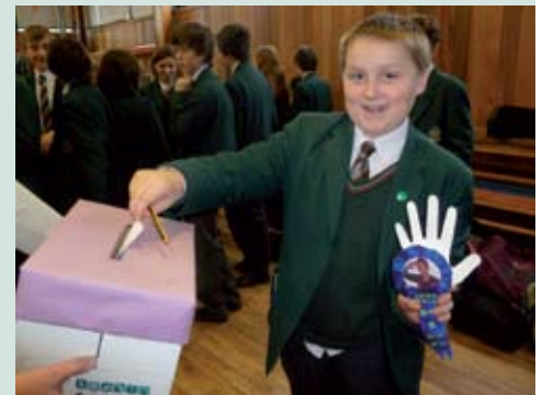
Casting the vote