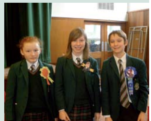
Mock election candidates