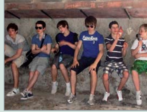
Resting in the shade