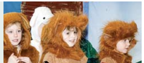
The animals get ready to get into the ark