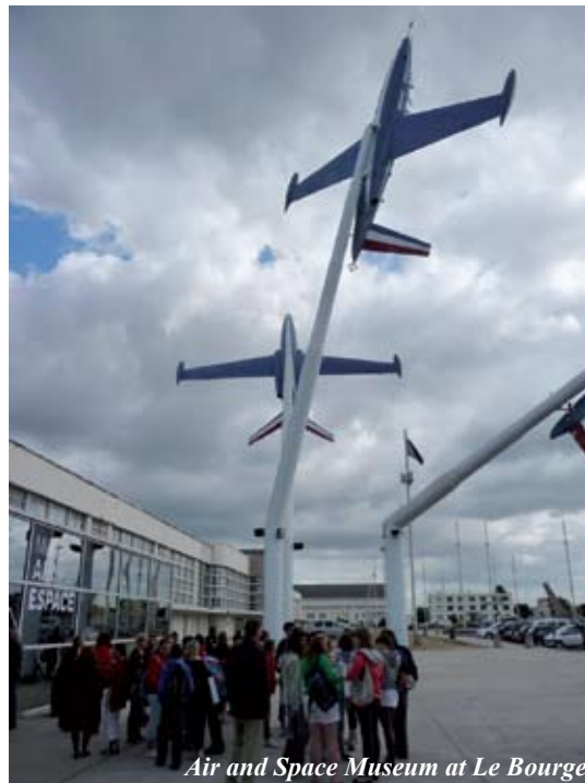
Air and Space Museum at Le Bourget