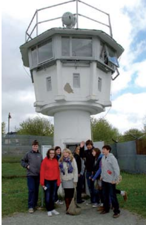
East German Guard Tower at Mödlareuth