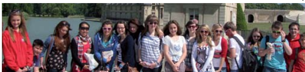
Outside the chateau at Chantilly

At the end of the week, Wellington pupils were disappointed that the volcano had ceased its activities and that their return to Scotland would take place as scheduled. At the airport the Wellington teachers struggled to encourage their group through security. The hugs and tears at the end of this year's French Exchange were a testament to the happy times the French and Scots had spent together.